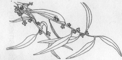
Scent Bark ( Eucalyptus aromaphloea ) buds and domed fruit

This comprehensive colour guidebook covers most parks. Want to know more? Call 13 1963 .