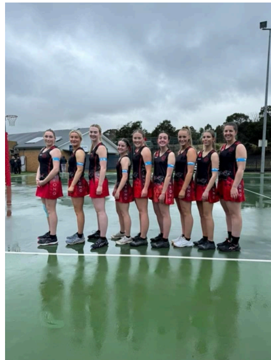
2024 "C" Grade

It's been a memorable year for all our teams, and the progress we've seen is a testament to the talent and dedication of our players and coaches. With so many bright young stars in our ranks, 2025 is already looking positive. We can't wait to see what the future holds for our club!