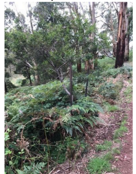
Above: Last remaining Dwarf Silver Wattle tree on Mount Buninyong