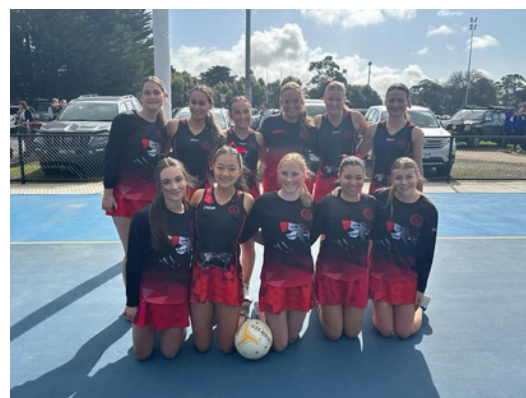
2024 17's & Under