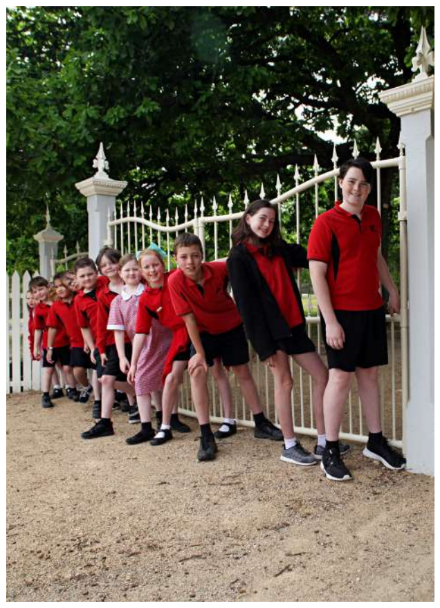
Primary school students check over the refurbished main entry gates to the Botanic Gardens. Council and the Friends of the Buninyong Botanic Gardens worked on the project.