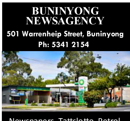
Newspapers, Tattslotto, Petrol, Car Wash, Dog Wash