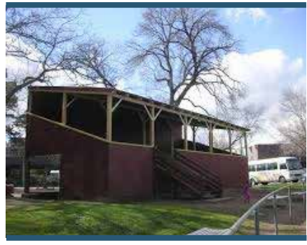
Buninyong racecourse grandstand now standing at the White Flat Reserve.

In 1934, the historic wooden racetrack grandstand from Buninyong was moved to the White Flat Reserve in Ballarat