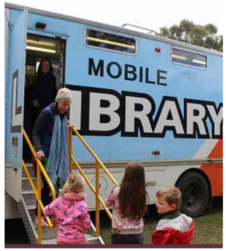
Local residents visiting the Mobile Library service.

Two years ago, the mobile library stop was cancelled. Local residents then took up the fight to keep their only regular community service and meeting point.